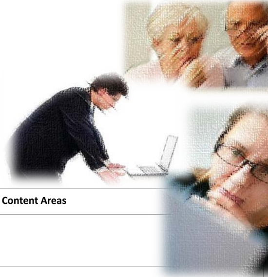
Site Traffic by Content Areas