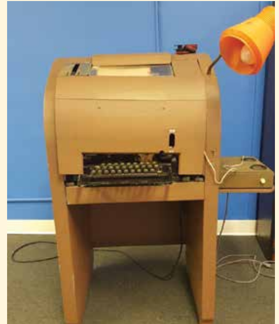
An original TTY

Contact MoreInfo@MDRelay.org with your name, location, and information about the device you'd like to donate. We appreciate your help in educating the community about these historical devices.